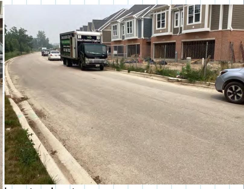
Streets good, minor trackout Recent disturbance from Nicor gas seeded